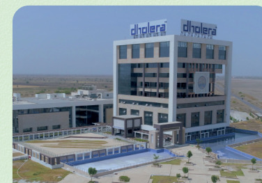
DHOLERA ABCD BUILDING 73 CR CONSTRUCTION COST