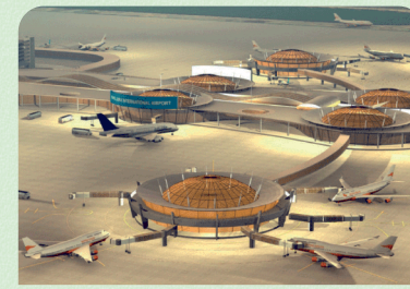
CARGO CUM PASSENGER INTERNATIONAL AIRPORT 987 CR TENDER ISSUED IN PHASE 1