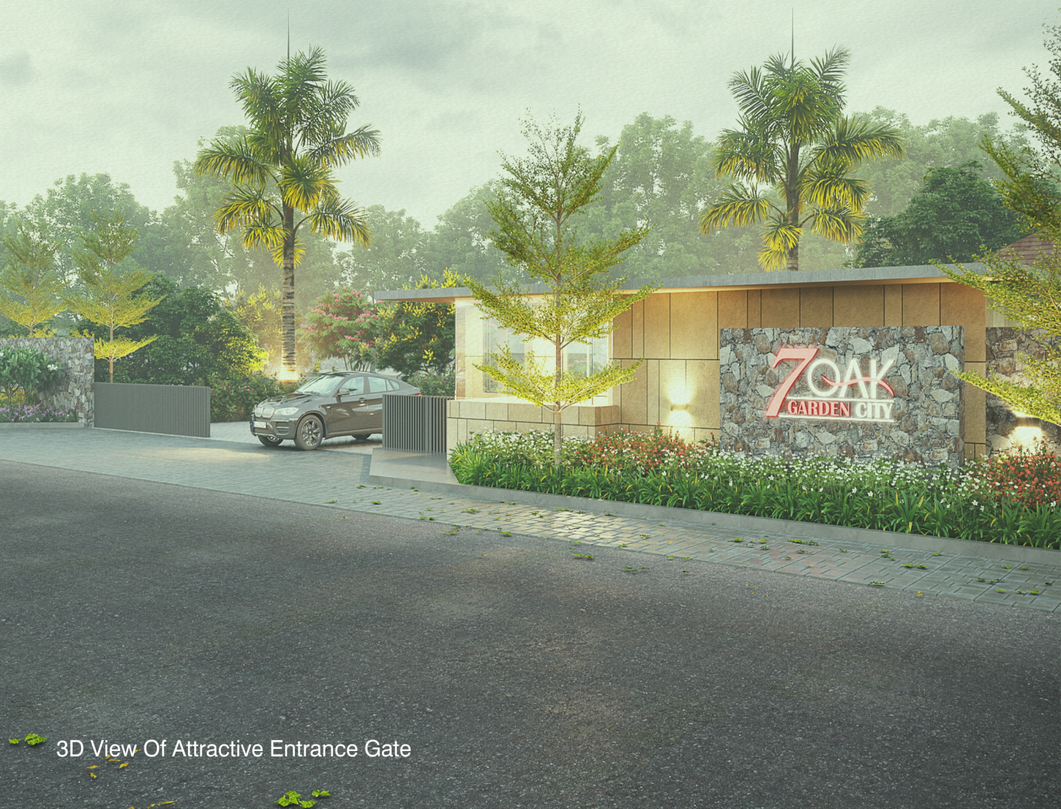
3D View Of Attractive Entrance Gate