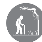
Senior Citizen Garden