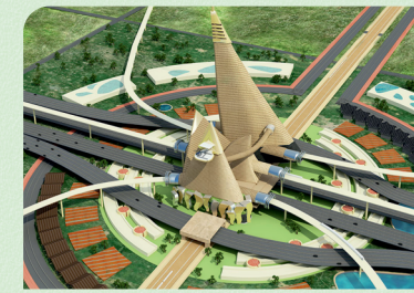
DHOLERA - SIR SMART CITY ENTRY GATE