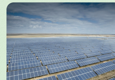
WORLD'S LARGEST SOLAR PARK 5000 MW 600 MW READY @ ACTIVATION AREA