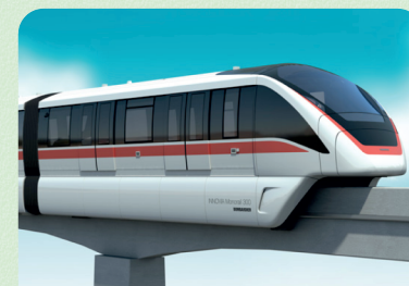
MONO RAIL CONNECTIVITY AHMEDABAD - DHOLERA