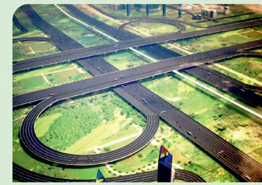
250 M WIDE 6 LANE AHMEDABAD-DHOLERA EXPRESS WAY 3157.82 CR TENDER APPROVED