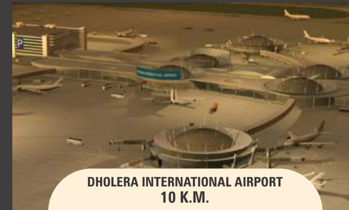
DHOLERA INTERNATIONAL AIRPORT 10 K.M.