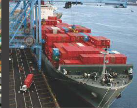
ON EXISTING PORT ROAD & FUTURE TP ROAD 1 MINUTE