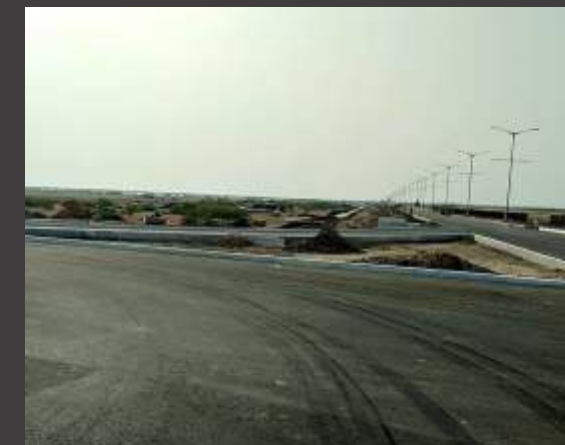
DHOLERA JUNCTION (AHMEDABAD-BHAVNAGAR ROAD) 1 MINUTE