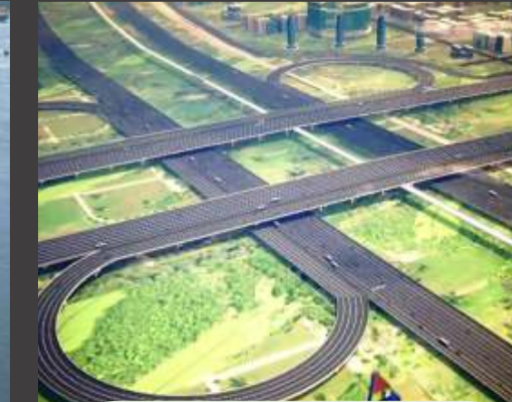
AHMEDABAD-DHOLERA EXPRESS WAY 1 MINUTE