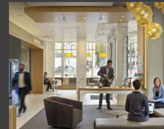
BANKS & RETAIL STORES 2 MINUTE