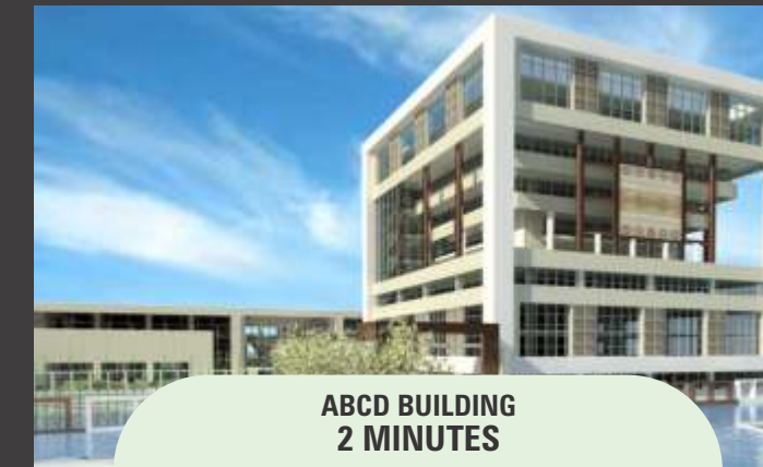
ABCD BUILDING 2 MINUTES