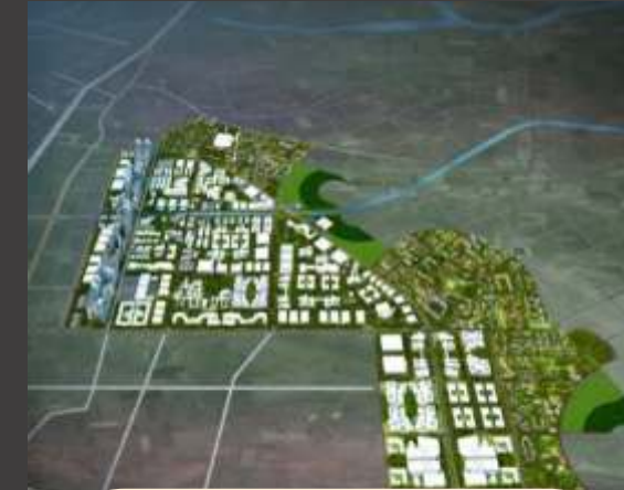
AT ENTRANCE OF SIR ACTIVATION AREA 300 Mtr.