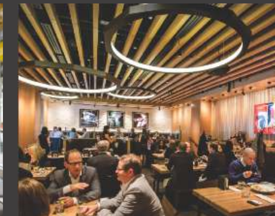
BUS STATION & RESTAURANTS 2 MINUTE