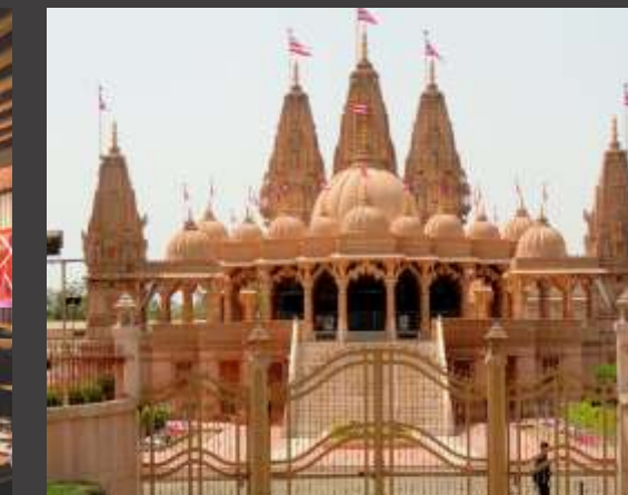
SWAMINARAYAN & JAIN TEMPLE 2 MINUTE