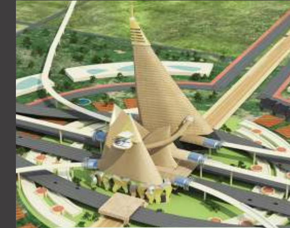
JUST BESIDES DHOLERA VILLAGE 1 MINUTE