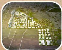
ACTIVATION AREA - 22.54 SQ. KM. READY FOR BUSINESSES