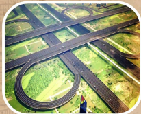
250 MTR. WIDE 6 LANE AHMEDABAD-DHOLERA EXPRESS WAY