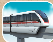
MONO RAIL CONNECTIVITY AHMEDABAD TO DHOLERA