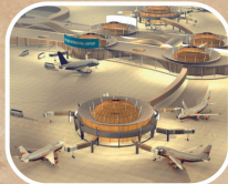
DHOLERA INTERNATIONAL CARGO CUM PASSENGER AIRPORT