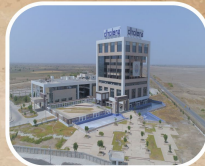
DHOLERA ABCD BUILDING