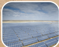
WORLD'S LARGEST SOLAR PARK 5000 MW