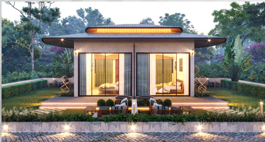
Leisure In The Heart Of Nature