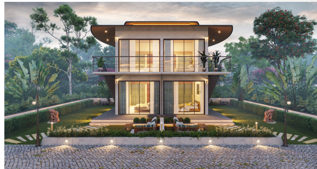
Bright & Airy Designed Homes